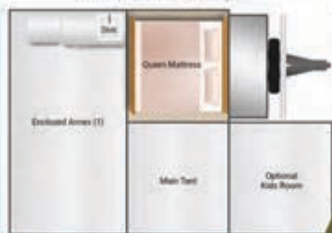
*Cadet* Soft Floor Camper

Battery Included + Optional Extra Available - 3 x 12v Sockets & 1 x USB port