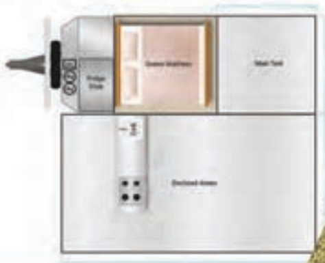
"Quest" Rear Fold Camper

Battery Included + Optional Extra Available - 3 x 12v Sockets & 2 x USB ports