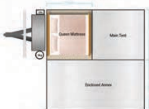
"Chase" Rear Fold Camper

Battery Included + Optional Extra Available - 2 x 12v Sockets & 2 x USB ports