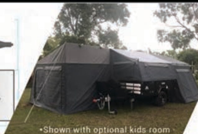
*Shown with optional kids room