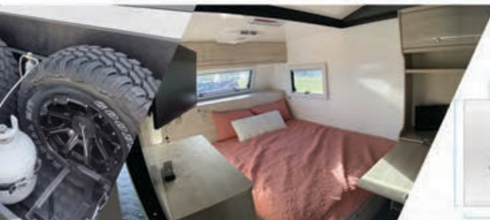
Upper Storage Layout