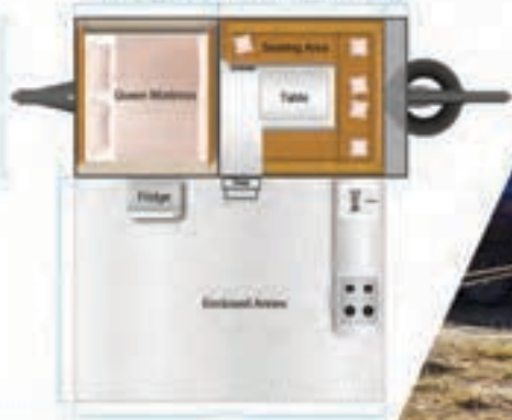
"Discovery" Forward Fold Camper

Battery Included + Optional Extra Available - 3 x 12v Sockets & 2 x USB ports